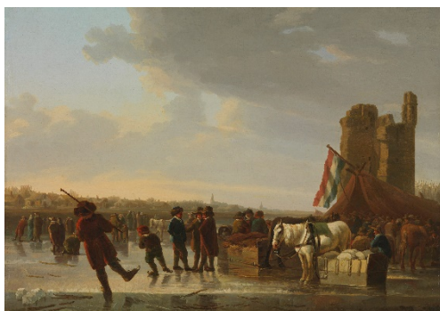
Copy after Albert Cuyp, On the Ice, 18th/19th century Oil on canvas, 66.8 x 42.3 cm

Bavarian State Minister of the Arts Bernd Sibler returns together with the Bavarian State Painting Collections, the Bavarian National Museum and the State Collections of Prints and Drawings, Munich, works of art, which were confiscated by the Gestapo, to the community of heirs from Europe, Asia and Africa.