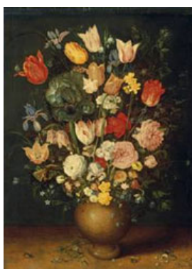
Workshop of Jan Brueghel the Elder Bouquet of Flowers in a Clay Vase, early 17th century, 70 x 52 cm, oil on oak