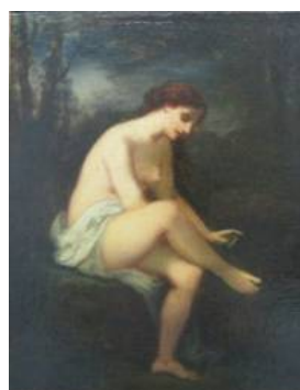
Left: Max Pechstein, White House, 1910, Watercolour and pencil, 14x11 cm Center: Max Pechstein, Meadow Valley, 1911, Watercolour and pencil, 15x10 cm Right: Narcisse Virgilio Díaz de la Peña, The Wounded Eurydice, 1862